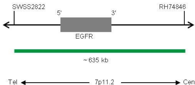
Fig. 1: SPEC EGFR Probe map (not to scale)

*according to Human Genome Assembly GRCh37/hg19