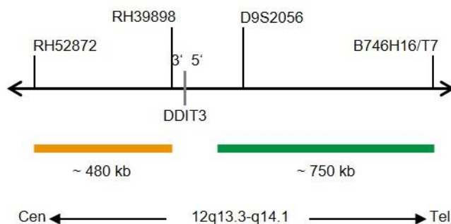
Fig. 1: SPEC DDIT3 Probe map (not to scale)

*according to Human Genome Assembly GRCh37/hg19